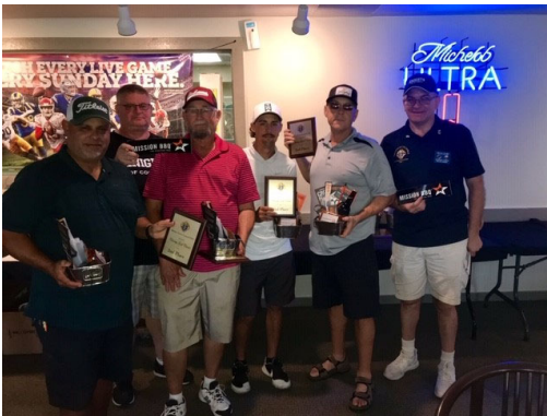
2 nd Place Team