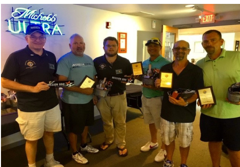
3 rd Place Team

Here are brother Knights who served at the annual Woman's Guild Tea.