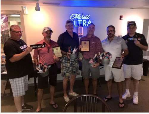
1 st Place Team